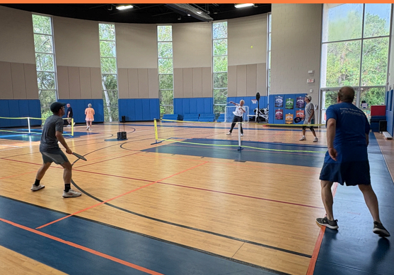
Sunday Pickleball BINGE group