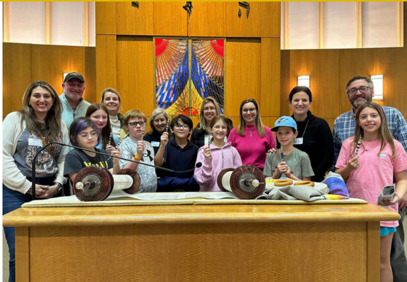
Fifth graders holding their personalized Yadayim