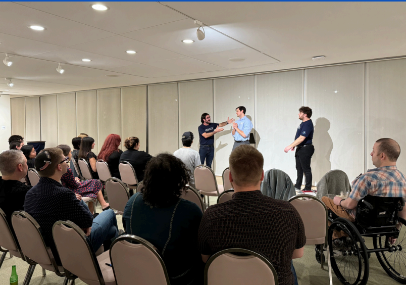
Unkosher Comedy Show with The Bible Players