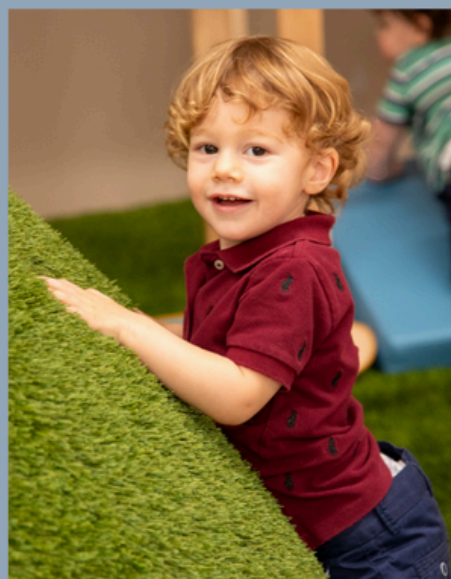
The Friedlander Family Play Space

The Shlenker School is proud to celebrate an exciting milestone in our Building for the Future campaign—the successful completion of Phase I . Thanks to the generosity of our donors, we have transformed key areas of our campus, including: