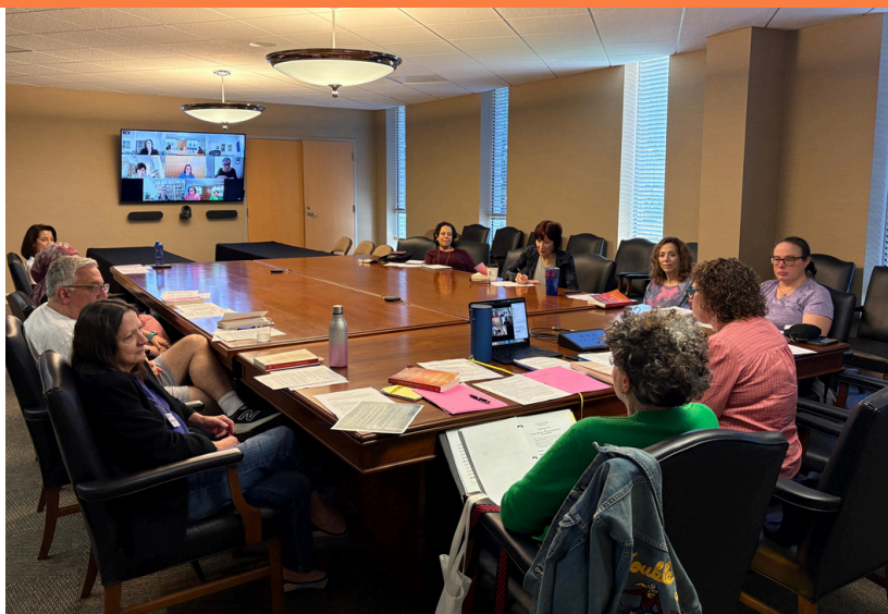
Monthly Mussar Learning BINGE group

Our BINGE groups (Beth Israel New Group Engagements) are fun affinity groups that promote new friendships and engaging discussions between Beth Israel members with similar interests. We encourage you to get involved with one of our thriving BINGE groups, or reach out to us with an idea for a new group. No prior experience is necessary to participate!