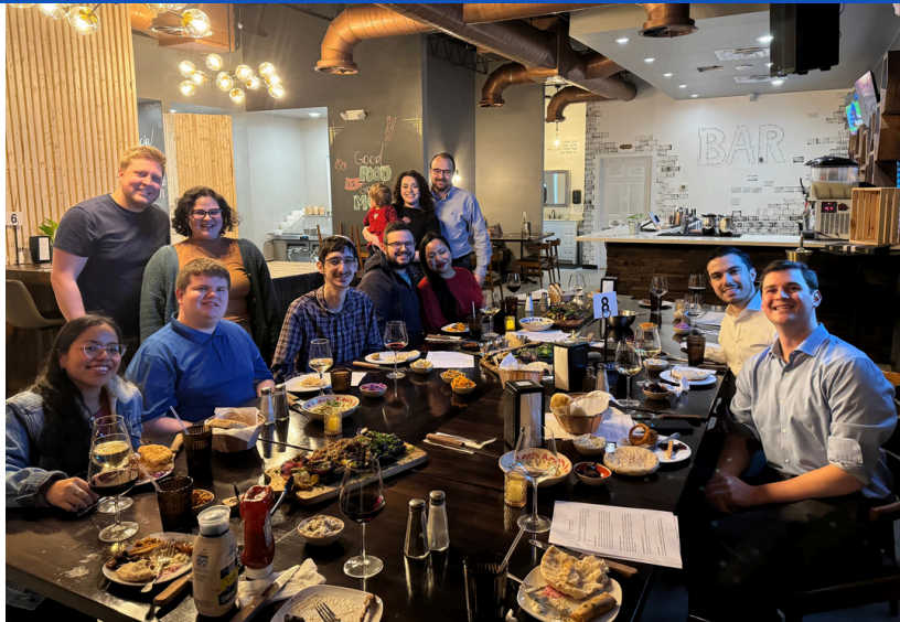
Celebrating Tu B'Shevat at Prime Grill & Bar