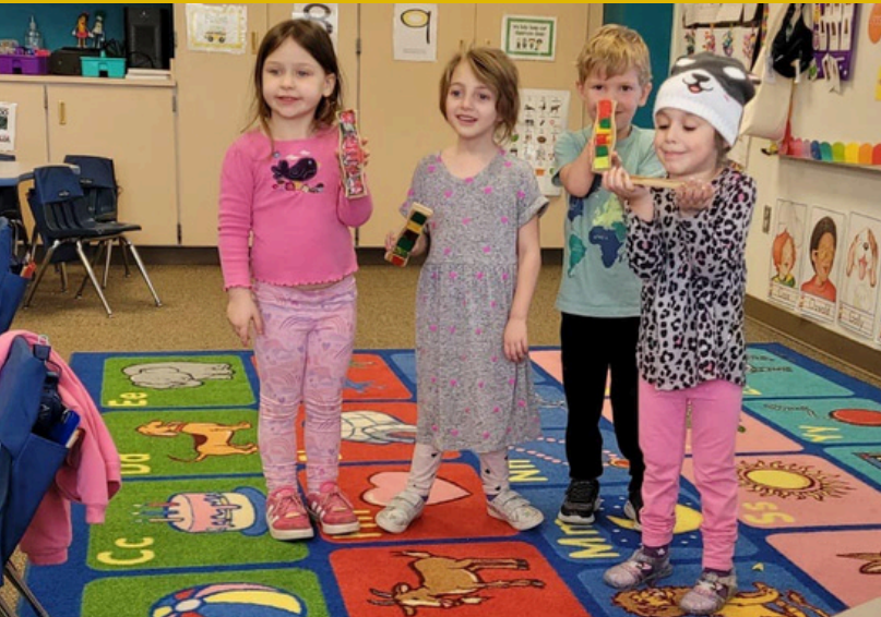
Fun in the classroom!

Providing fun, stimulating learning and social activities for children & families